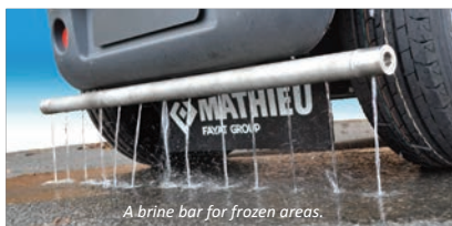
A brine bar for frozen areas.