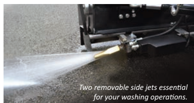
Two removable side jets essential for your washing operations.