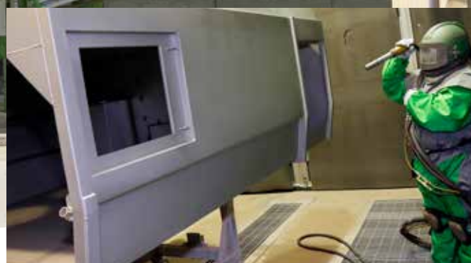
Shot blasting the hopper's stainless steel body

The hopper is manufactured from strong, corrosion and abrasion-resistant 4003 Stainless Steel which is then shot blasted before a two-pack epoxy primer is applied, followed by a hard-wearing topcoat.