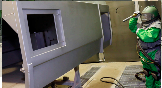
Shot blasting the hopper's stainless steel body

The hopper is manufactured from strong, corrosion and abrasion-resistant 4003 Stainless Steel which is then shot blasted before a two-pack epoxy primer is applied, followed by a hard-wearing topcoat.