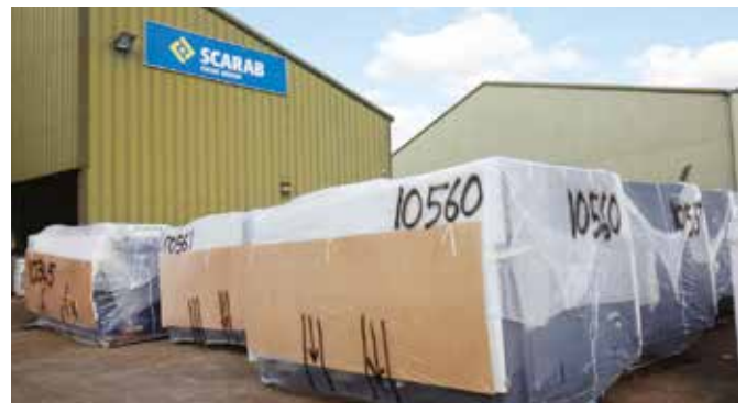
Export skid unit packaged and ready to ship

Thanks to our comprehensive network of trusted dealers worldwide, our export skid units can be distributed to even the most remote locations. Our dealer network is a collection of specially selected sweeping experts, each equipped with dedicated Scarab knowledge and access to our innovative products to help clients meet the demands of their operations. Spread across six continents, our network is continuing to grow as we look to offer our technical and commercial innovations to as many countries as possible.